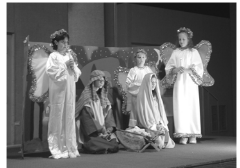
Picture form the a previous pageant