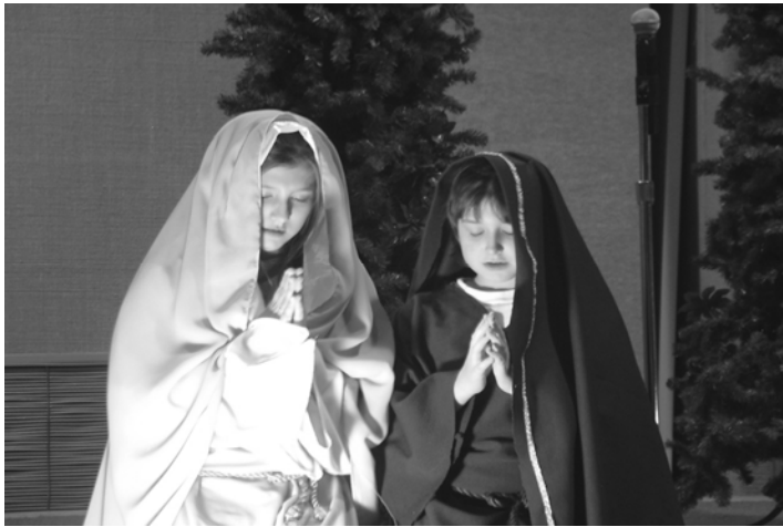
Picture form the a previous pageant

Three rehearsals are necessary as follows: Saturday, December 10,- 9:00 to 9:45 am in the Parish Hall Saturday, December 17,- 9:00 to 10:15 am in the Church Thursday Eve, December 23, -6:00 -7:15 pm in the Church